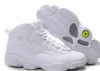
Air Max 24/7 Shoes black grey ID:5847 Free Shipping